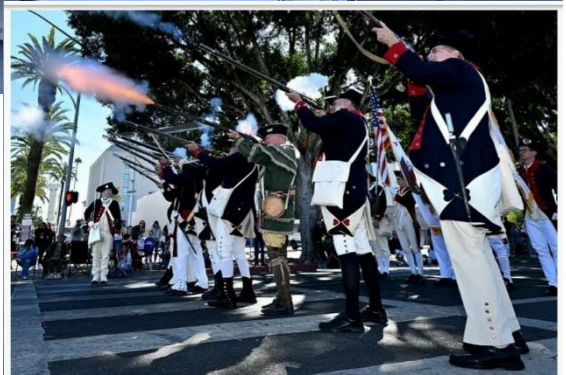
Sons of the American Revolution fire their muskets as they march along Market Street on Saturday, Nov. 9, 2024, during A Salute to Veterans Parade in Riverside.